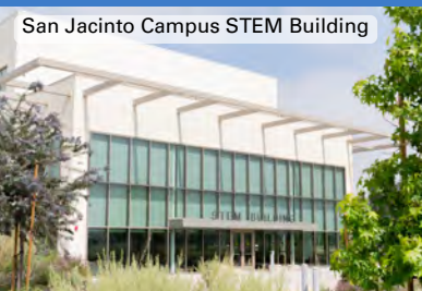
San Jacinto Campus STEM Building