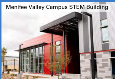
Menifee Valley Campus STEM Building

In November 2014, voters in the 1,700-square-mile MSJC district approved a bond measure of $295 million to build and upgrade facilities to train residents for jobs and help students achieve their academic goals. Two of the most significant projects, STEM buildings at the San Jacinto and Menifee Valley campuses, will shortly allow MSJC students to learn in improved environments throughout the district.